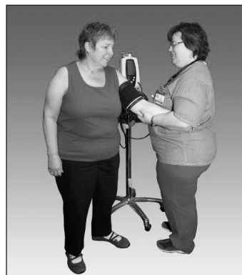
Figure 2. Proper measurement of a standing blood pressure requires complete arm support with cuff at heart level. Hold the arm if an adjustable table is unavailable.

For which patients is a standing blood pressure measurement most appropriate, and what is the proper technique for obtaining one? Particularly in patients who are \geq 70 years old and taking antihypertension medications, obtaining standing blood pressure measurements should be routine practice. Although the sitting blood pressure measurement represents the standard in hypertension treatment trials, standing systolic pressure decreases of \geq 20 mm Hg, consistent with a diagnosis of orthostatic hypotension,