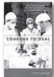
Book Reviews page 95

CME available online: www.kp.org/permanentejournal See page 3 for details.